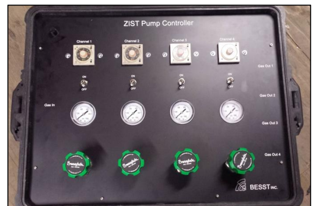
Figure 2- A 4-channel Timer Control Unit, used for nested or nearby wells